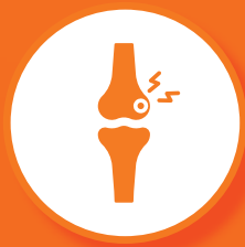
BONE MARKERS (SERUM)