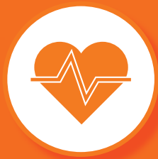
BRAIN NATRIURETIC PEPTIDE (BNP)