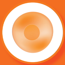
ANTI MÜLLERIAN HORMONE (AMH)